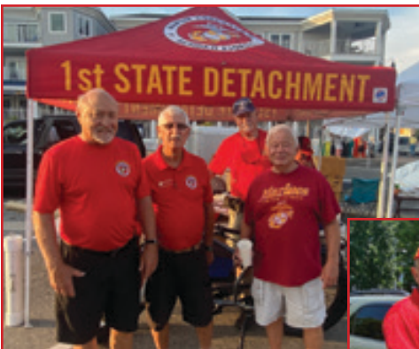
Just an early handful of the First Detachment members who helped at the Bethany Beach Arts Festival. These were part of the Dawn Patrol, arriving at 5:30 to lay out spaces for the exhibitors