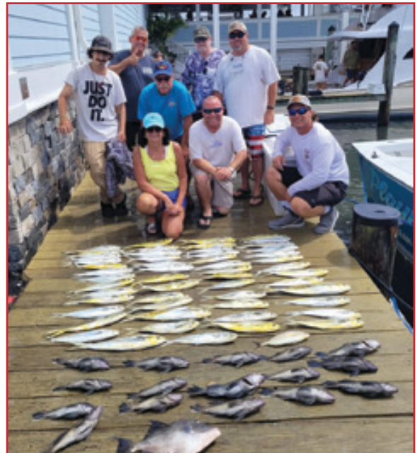
The fishing group and the Playmate crew with their catch.