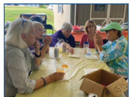
There's always time to socialize at a picnic