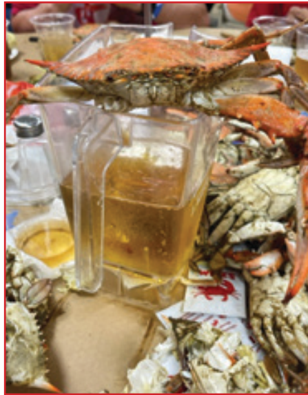
If you do, here's what's in store for you.