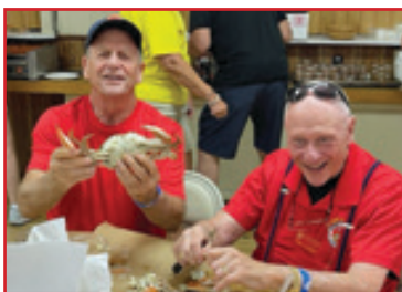
That's a big one you're holding