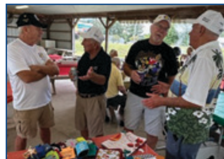
The guys also had a lot to say