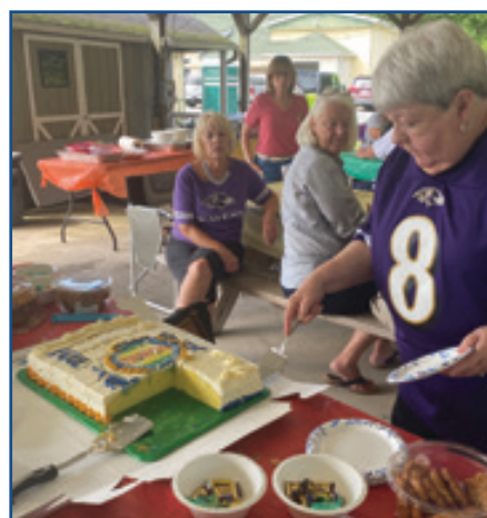
Cutting the cake