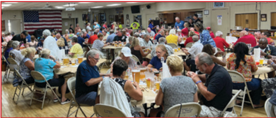
The house was packed