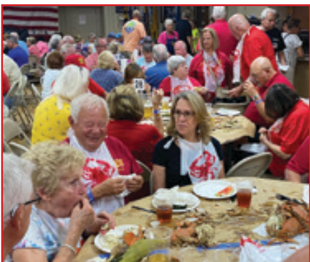
The Men in Red were there in force with spouses