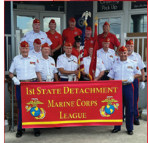
FSD at the Bethany Beach Fourth of July Parade