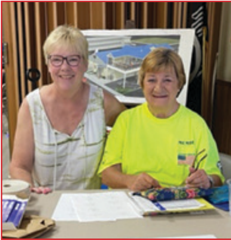
The first step. You have to pay to get in.