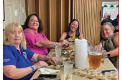
And pitchers of beers and happy ladies