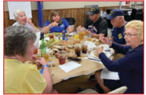
With full tables of diners and crabs.