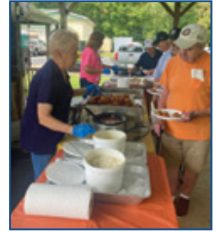
The chow line