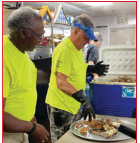
In the kitchen a box of hot crabs transferred to trays for delivery