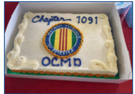
The annual cake arrived