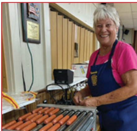
Hot dogs? Who eats hotdogs at a crab feast?