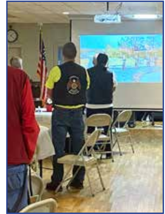
Audience stands watching color guard video at Veterans Memorial