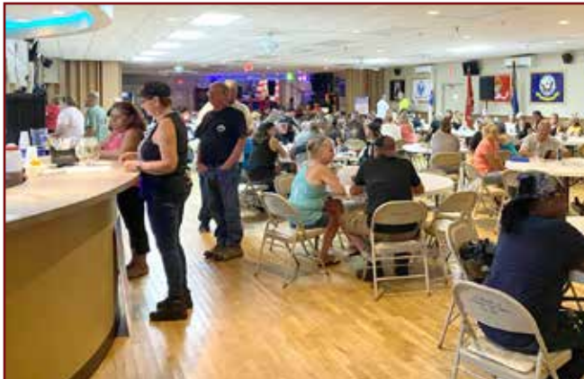
Busy back bar