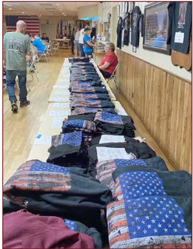
Shirts for sale