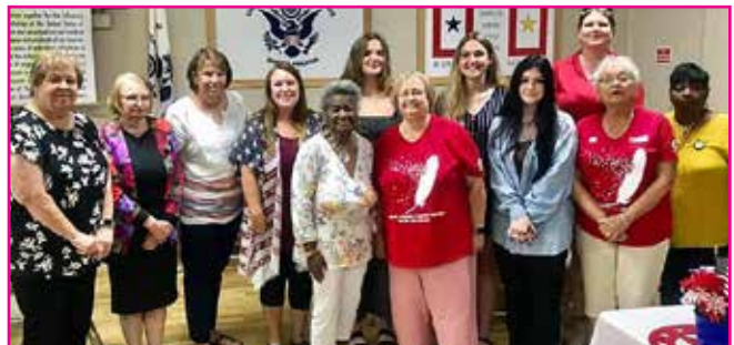
Attendees at the Junior Annual Conference for the Dept of MD held at Post 166 on 7/10/21