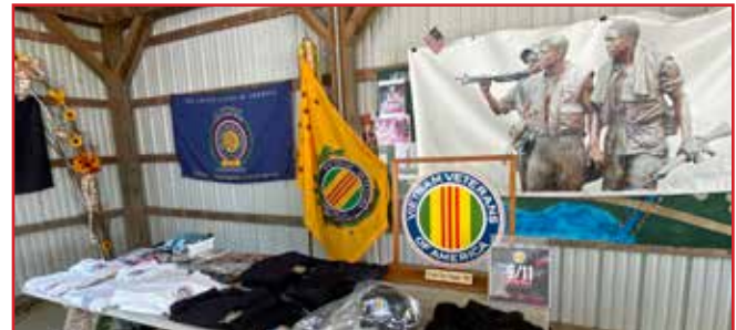
VVA logo items for sale