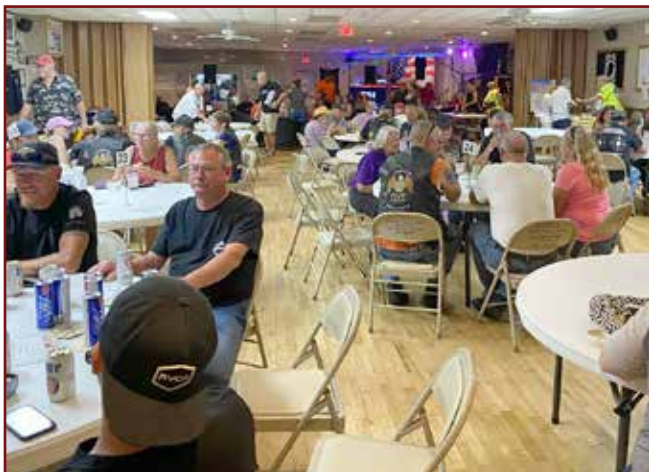
Main Hall was filled