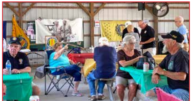
A few more faces in the crowd