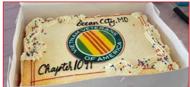
Tradition Picnic Cake