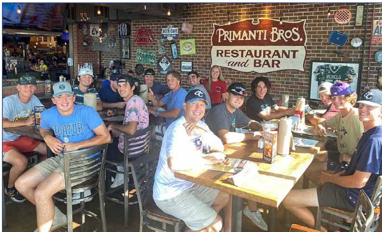
Team Dinner after the Marlins won their first District Playoff game.