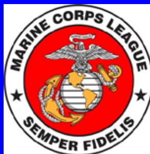
First State Detachment