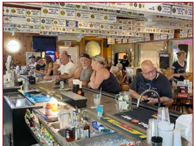
Crowded front bar