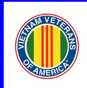
VVA Chapter 1091

Thank you Ocean City Today for contributing space so we could present this message