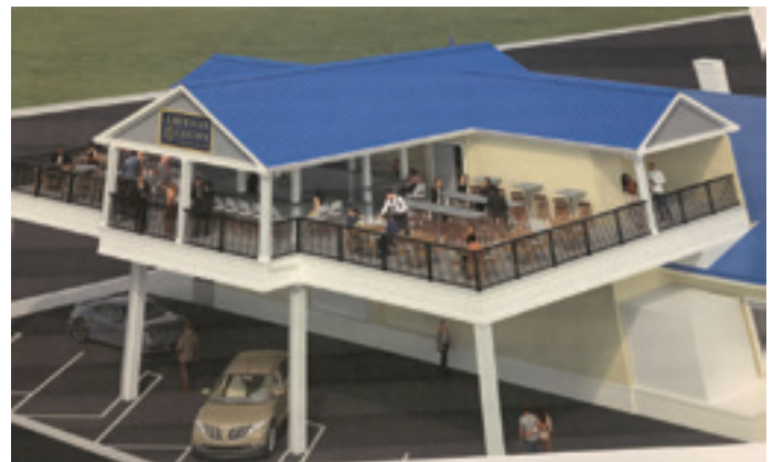
Another view of how the patio/deck will look when finished.