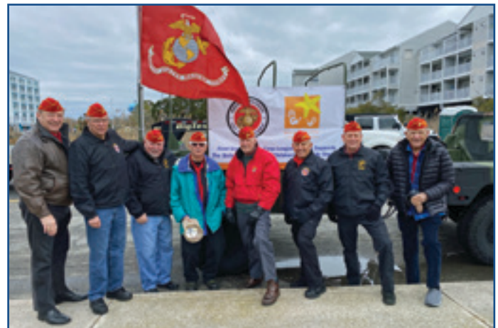
First State Detachment Marines at St. Patrick's Day Parade