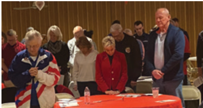
Standing for the invocation