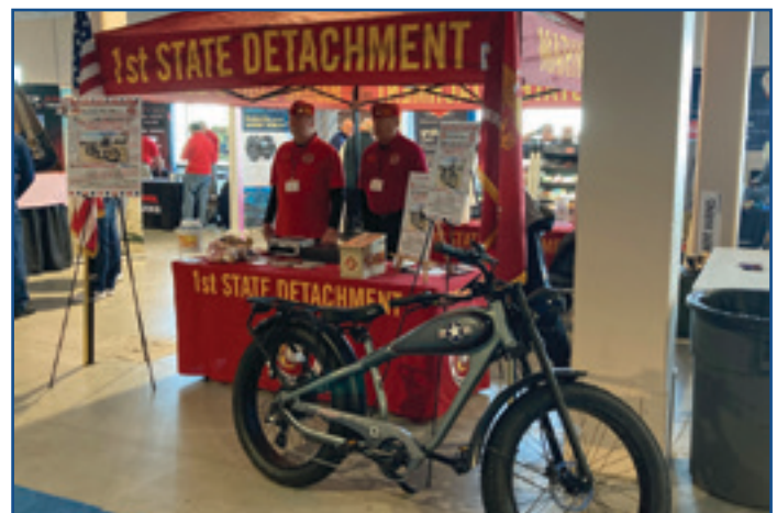
First State Detachment Tent and volunteers selling this year's bike raffle tickets