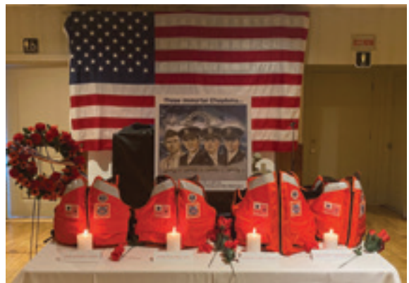
The Final Table with four life jackets, poppies, roses, and burning candles in observance of the sacrifice of The Four Chaplains