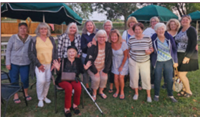
The book club at Windmill Creek Winery