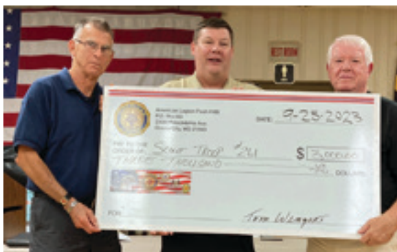
Checkout Page 16.

Your contribution helped make it happen!