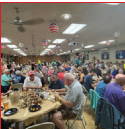
The Hall was filled as usual