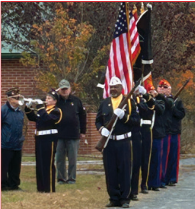
Join Color Guard posts the Colors at the 2023 Observance