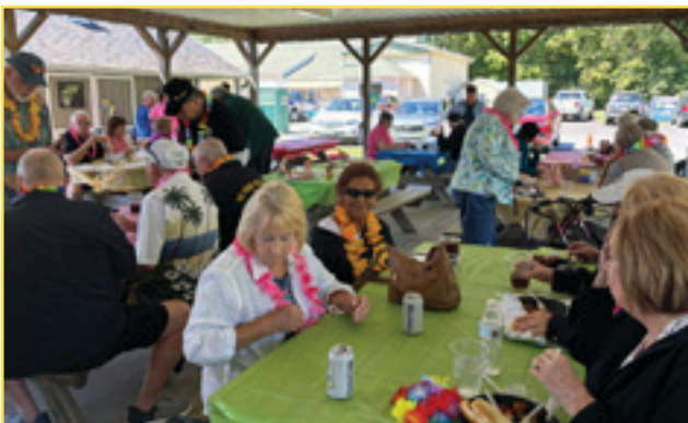
At the VVA 1091 the Pavilion was packed