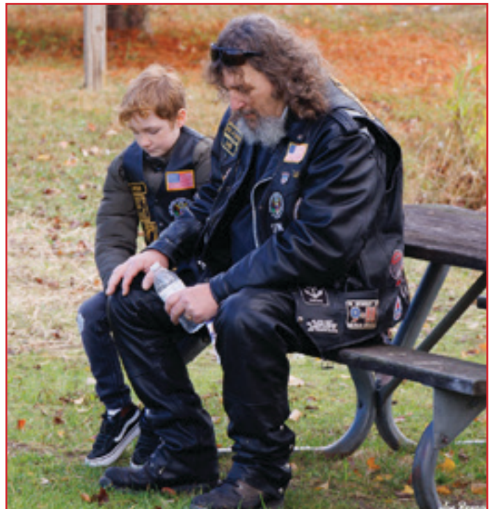
A father and son with heads bowed at last year's observance