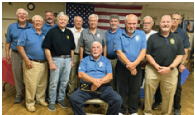
The 2024-2025 Officers and Executive Committee