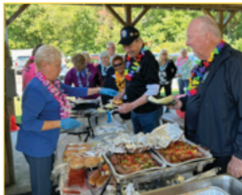
Food was Served